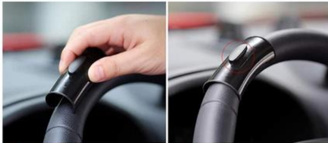
1 choose installation place 2 install it on the steering wheel