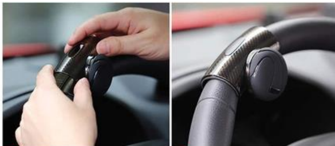
3 clip booster ball on the inner layer 4 installation finished